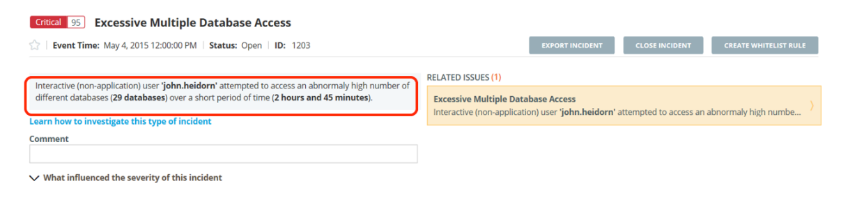
Figure 2: Incidents are assigned a risk score and grouped with related incidents giving security professionals actionable insights to quickly respond.